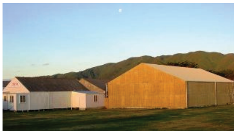
A new extension to the stadium has been completed