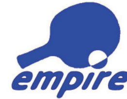
Table Tennis Club

The club that shows the way for table tennis in greater Wellington.