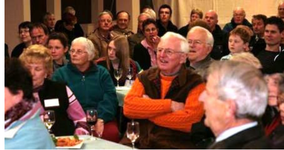
70+ members and guests attended the launch

" Empire Table Tennis Club, 75 Years Old and Growing " is 84 pages in total and illustrated by 196 photographs. It was published and printed in Wellington by First Edition Ltd. It is available at the club at a cost of $30.