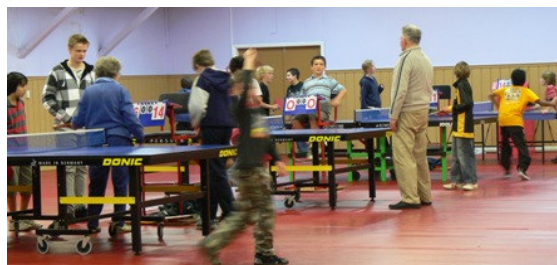
Junior Club in action.

We have been fortunate to have some parents and grandparents of our junior players having a hit most weeks.