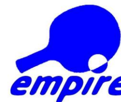
Table Tennis Club

The club that shows the way for table tennis in greater Wellington.