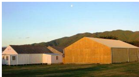
The stadium highlighting the newest part